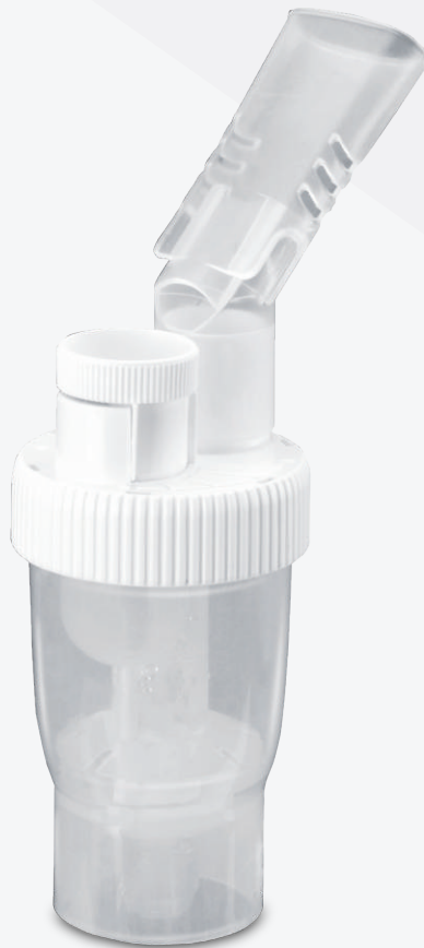
• Nebulizer kit + Mouthpiece

N1 Patent Nos : ZL 2012 2 0443597.3 Other patents pending