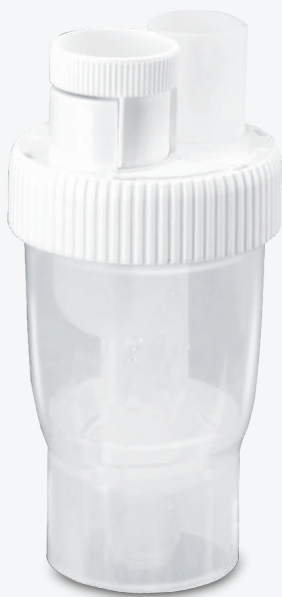
• Nebulizer kit