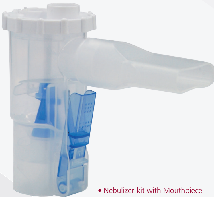
• Nebulizer kit with Mouthpiece

N3 Patent No. : EP238035 D140311 M388940 M411285 ZL201020179254.1 ZL201120021244X