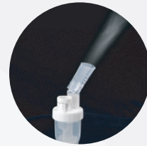
Closed Valve > 0.10 ml/min (for NB80) Closed Valve > 0.15 ml/min (for NA100/NB500) (0.9% Saline Solution)