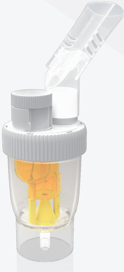
• Nebulizer kit + Mouthpiece