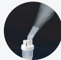
Fully opened Valve > 0.22 ml/min (for NB80) Fully opened Valve > 0.30 ml/min (for NA100/NB500) (0.9% Saline Solution)