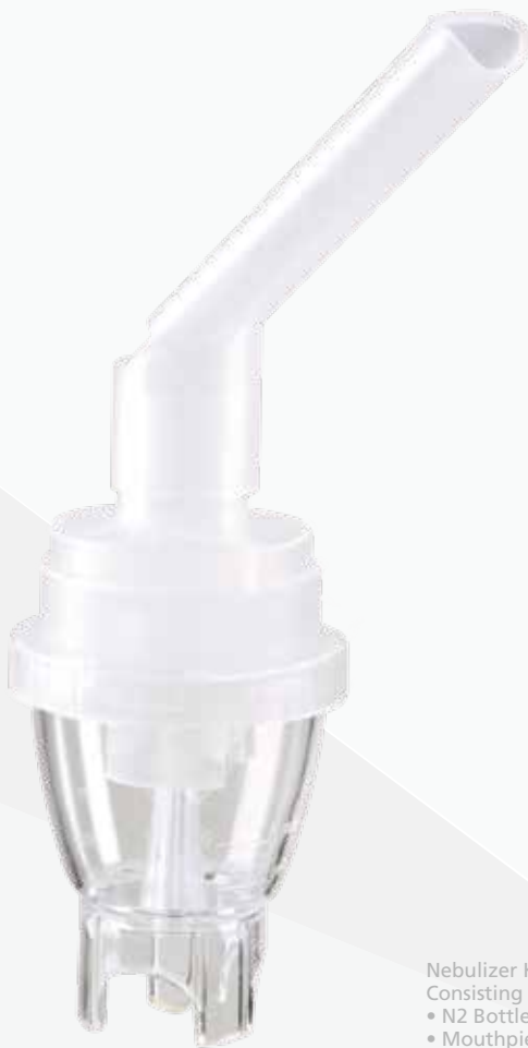
Nebulizer Kit Consisting of: • N2 Bottle • Mouthpiece