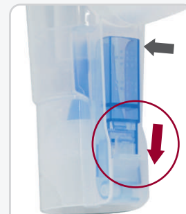
Lock on - continuing mode