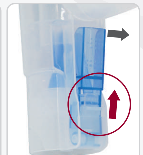
Lock off - discretionary operation