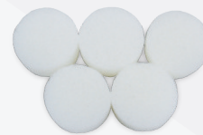
Filter (5 pieces)