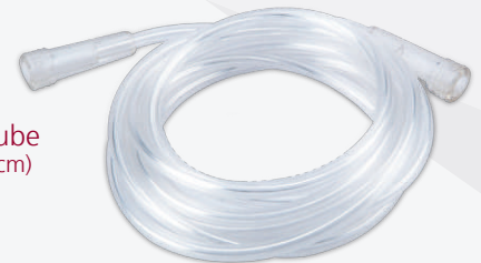
Air tube (210cm)