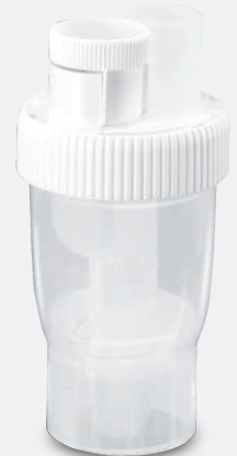
Nebulizer kit (N1)