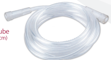
Air tube (210cm)