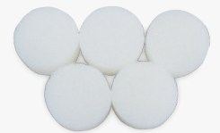
Filter (5 pieces)